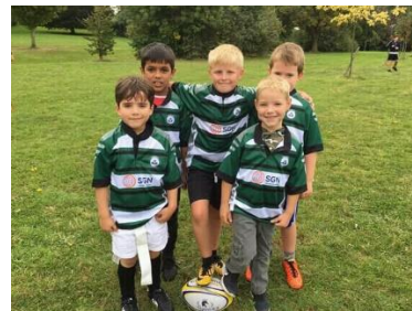
A few of our youth sporting their new shirts sponsored by SGN